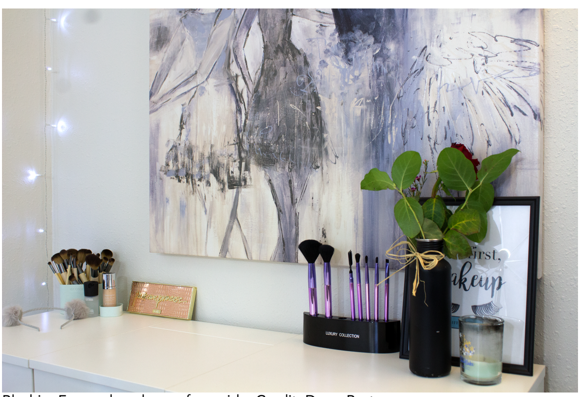
BlushingForward work area from side. Credit: Dawn Burton