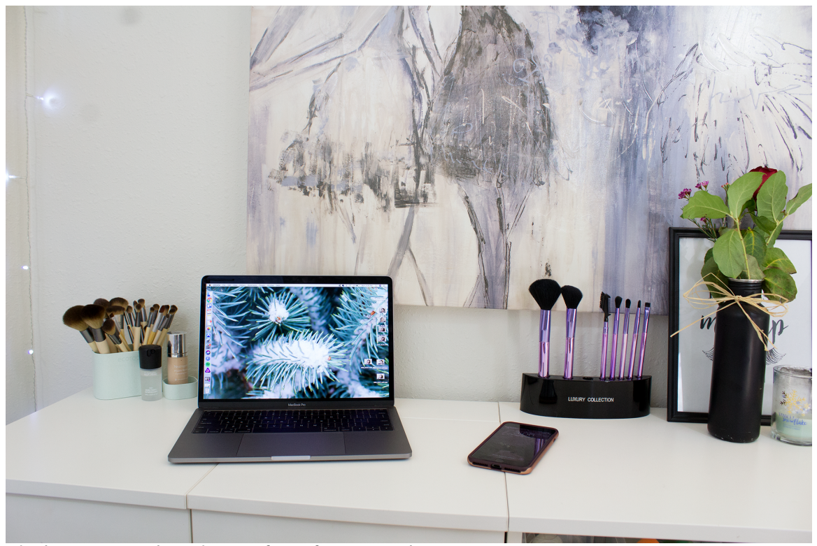
BlushingForward work area from front.